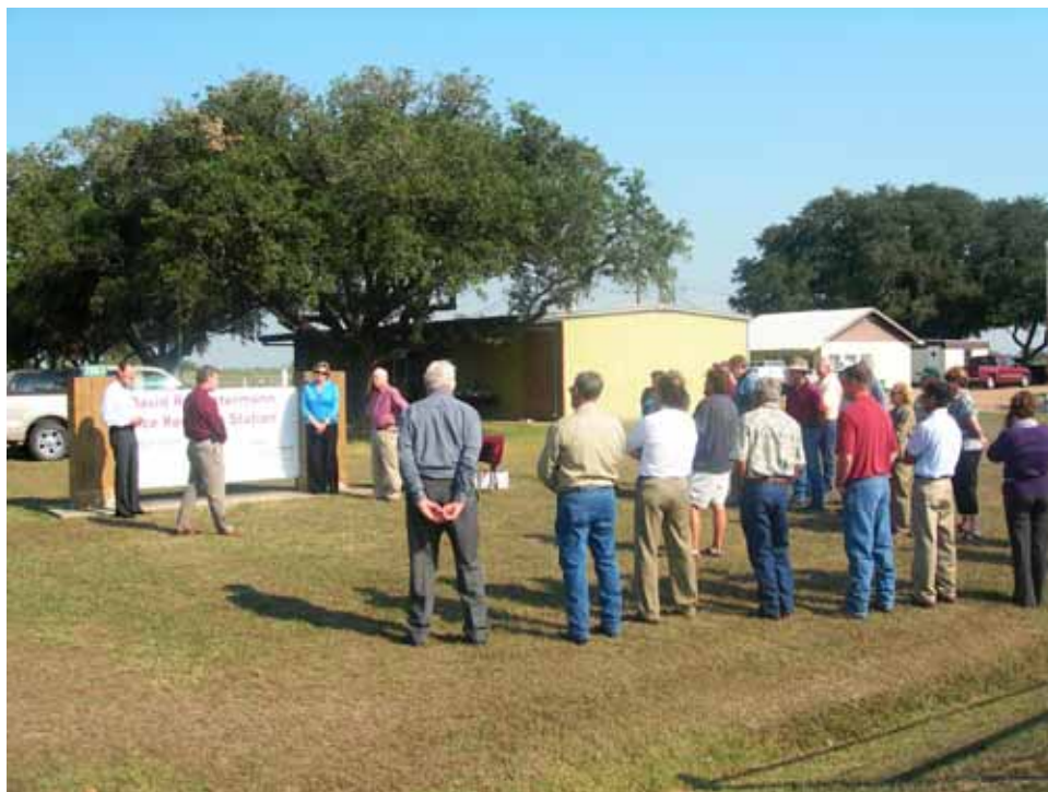
Fig. 1. Ribbon cutting ceremony at the David R. Wintermann Rice Research Station at Eagle Lake, Texas, last September 26, 2008.