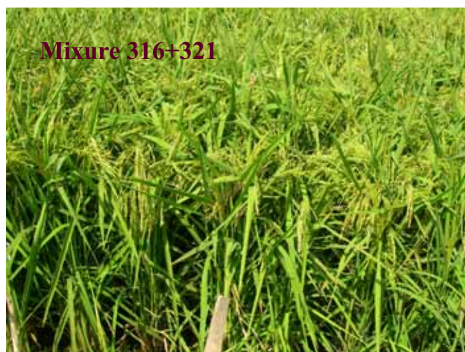
Fig. 1. High yielding Entry 316 (blast susceptible), Entry 321 (blast resistant), and its mixture at the grain filling stage in a yield trial at the Texas AgriLife Research and Extension Center at Beaumont in 2008.