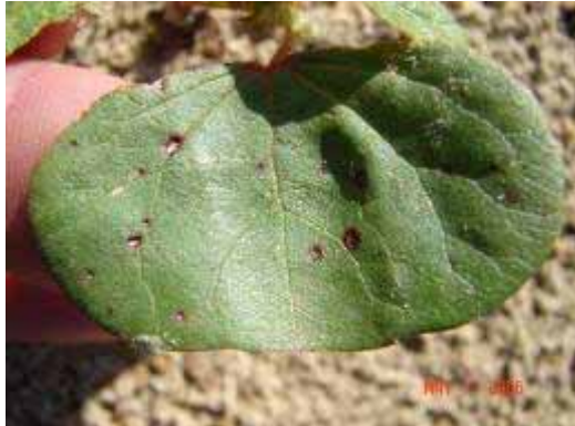
Figure 1: Typical Reflex injury.