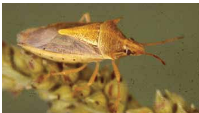
Figure 1. Rice stink bug adult.

All three insecticides had excellent contact mortalities of rice stink bug adults (Table 1). Mortalities of bugs placed on panicles one day after applications were also excellent. This was truly a surprise that bugs had any mortality the next day after foliar treatment with KarateZ. Usually with KarateZ observed mortalities one day after treatment have been between 0 and 20%. Even more surprising was mortalities of caged rice stink bugs also occurred on days 2 through 7 in the KarateZ treatment. The results in this test with KarateZ have never been observed in any other similar type test.