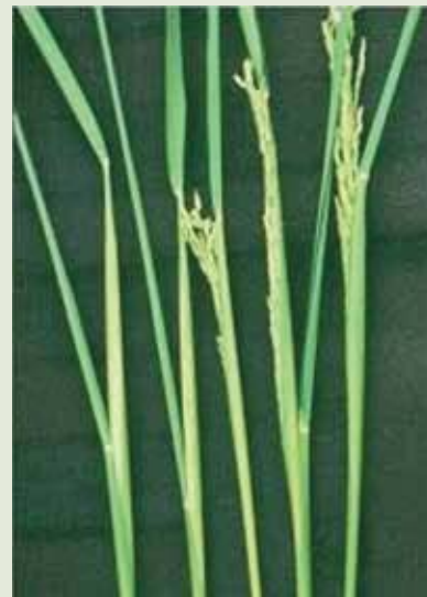
Fig. 5. Rice growth stage for first fungicide application to prevent neck blast

As previously mentioned, we plant half our acres in blast susceptible varieties. Why? Because many of the highest yielding varieties available are also susceptible to blast. While yield is the most important trait, high yield alone does not make a good variety. Under our conditions, developing and planting varieties with high yield and manageable disease resistance is essential,