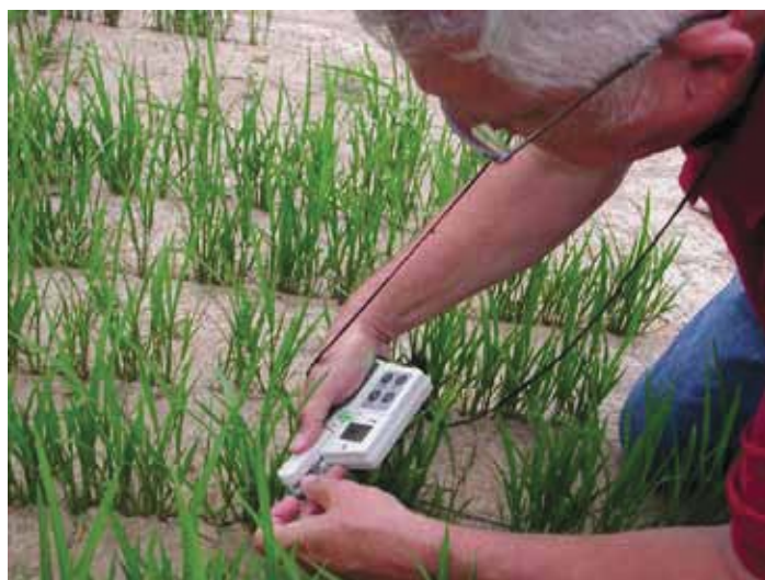
Figure 2. Using the SPAD meter to measure leaf chlorophyll content.