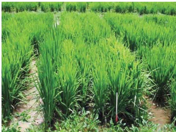
Figure 1. Stay-green and non-stay-green plants in the field.