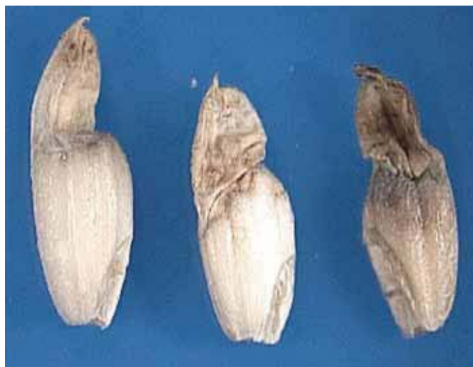
Figure 2. Examples of kernels where feeding as removed the contents and fungal infection has caused some discoloration.