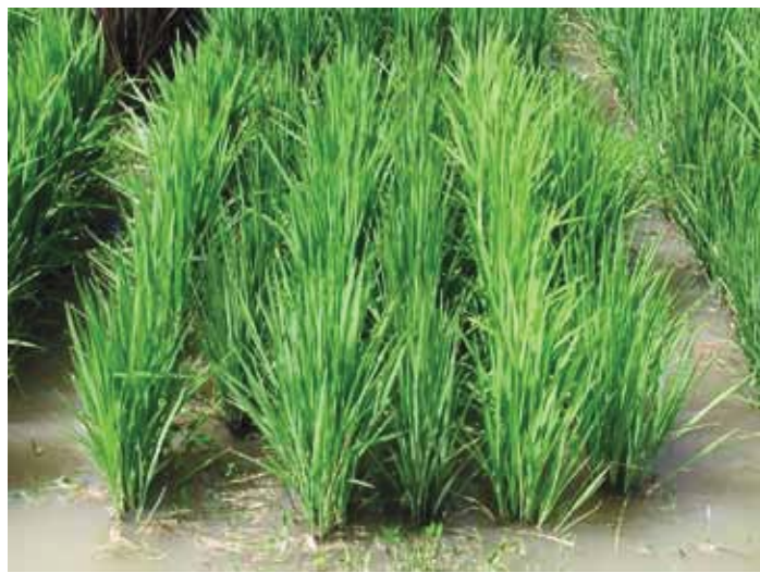
Figure 3. Color variation in panicle rows of the cross 030459.