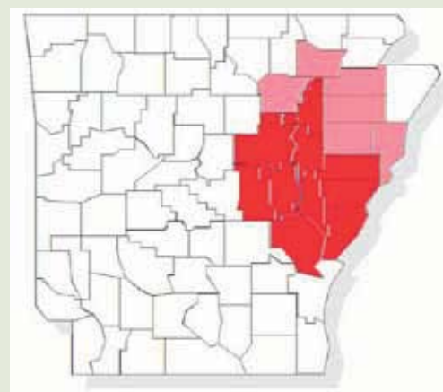
Fig. 4. Arkansas counties with noted blast damage