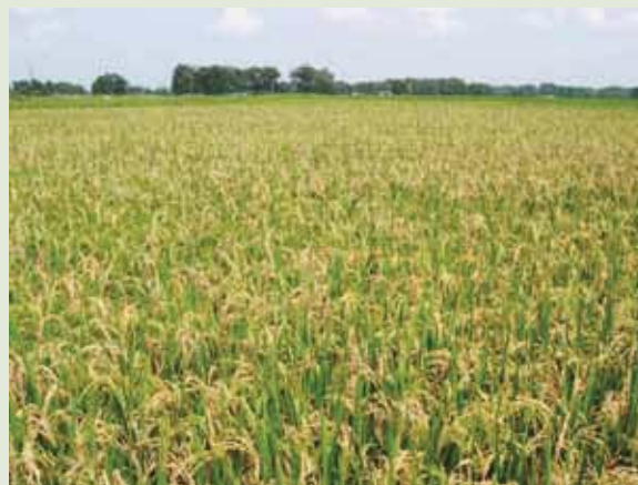
Fig. 3. Francis rice field, heavily damaged by neck blast