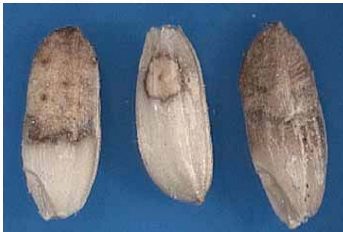
Figure 3. Examples of kernels where fungal infection has caused surface and internal damage and discoloration.