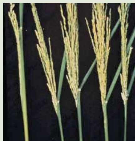
Fig. 6. Rice growth stage for second fungicide application to prevent neck blast.

and 2009 reminded us about that balance in what we grow. CL 151 and Francis, with the highest risk for blast damage, are great varieties when planted in wide open, flat fields with excellent water management and no strong history of blast, but they are a terrible choice for sandy fields, furrow irrigation or other systems that strongly favor this disease. While expensive, current hybrid rice varieties are the best choice for fields with a strong history of blast, or rice production systems that favor neck blast, because hybrids have high yield potential combined with very good disease resistance. A good future choice for very blast-prone systems would also be the recently released variety from the Arkansas breeding program, called Templeton, that has good