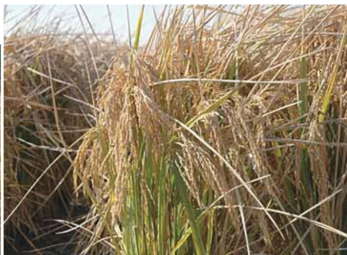
Breeder head row seed plots of breeding line RU0801076, which has been released as the new variety, 'Roy J,' which were planted April 8, 2000, are pictured on Nov. 19, 2000, at the Rice Research and Extension Center.