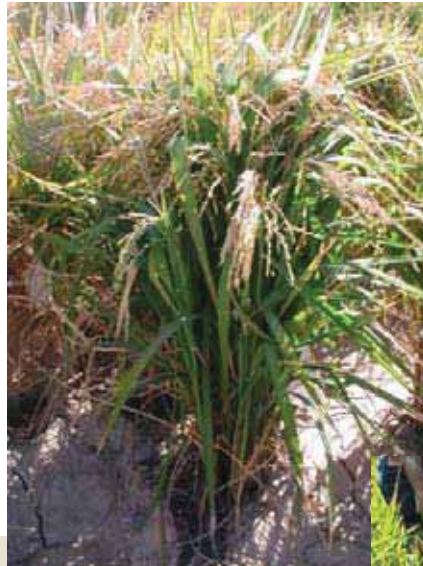
Semidwarf breeding line at harvest, Stuttgart, 2008.