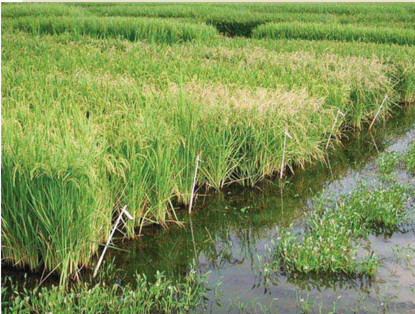
Plot of RU0701124 third stake from left, Stuttgart.