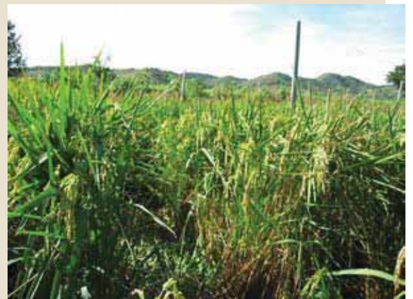
Seed purification of semidwarf experimental line STG05AC-02-103 in Puerto Rico, 2008.