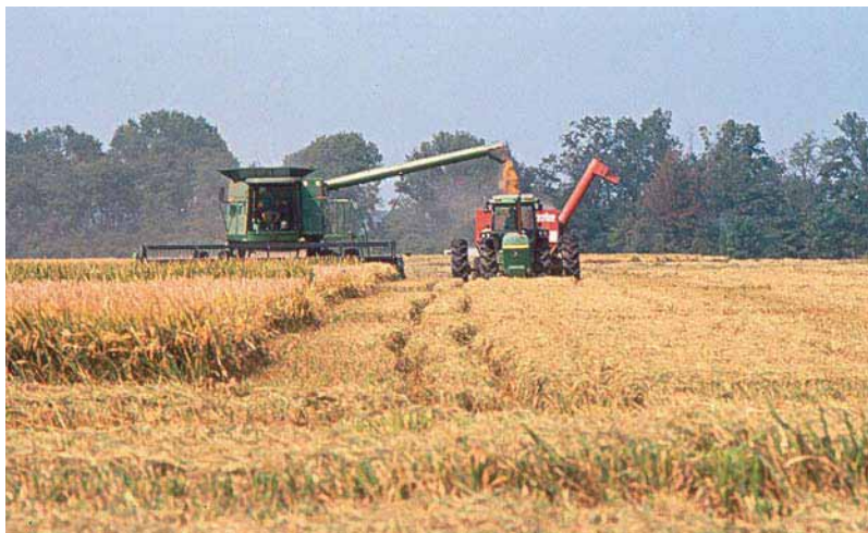
Carbon credits could encourage landlords to support no-till rice on rented acreage.