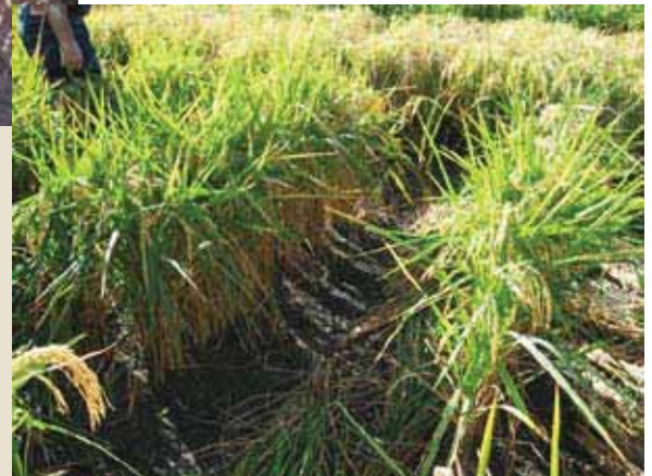
Seed purification of semidwarf experimental line STG05F5-02-091 in Puerto Rico, 2008.